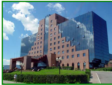
Address: Tokyo street-10, Ulaanbaatar-49, Mongolia. Chinggis Khaan Hotel Complex

will also be provided. A meeting room with a capacity for 20-30 people may be arranged. More info about the complex is available at www.chinggis-hotel.com .