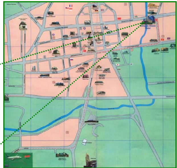
Site map of the Chinggis Khaan complex